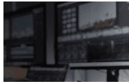
On-Demand Transparency Through Video: Best Practices for Creating Critical Incident Videos