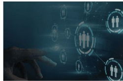
On-Demand Using Grant Funding to Enhance Your Recruitment Strategy