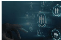
On-Demand Using Grant Funding to Enhance Your Recruitment Strategy