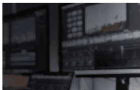
On-Demand Transparency Through Video: Best Practices for Creating Critical Incident Videos