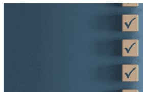
On-Demand Every Day Is a Training Day: The Value of Daily Training on Policy