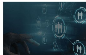
On-Demand Using Grant Funding to Enhance Your Recruitment Strategy